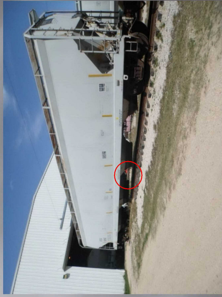
RAILCAR JUST SOUTH OF THE RAILCAR REPAIR SHOP, PELLETS ARE OBSERVED ALONG THE TRACKS.