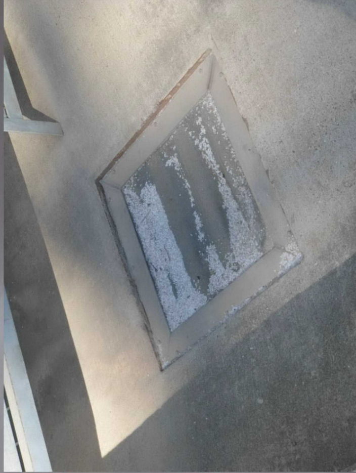
CLOSER IMAGE OF DRAIN.