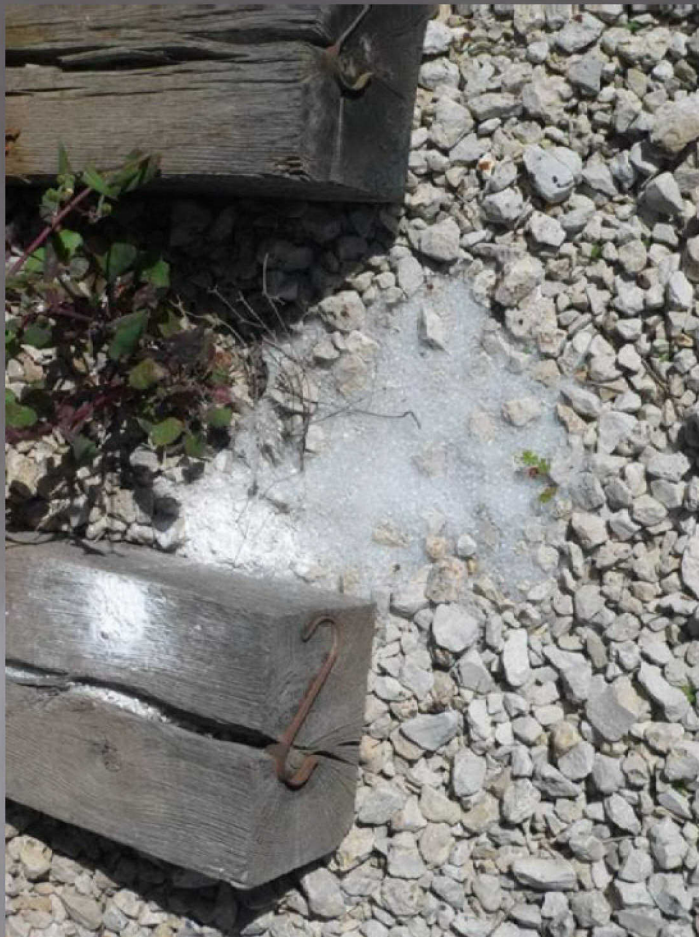
CLOSER IMAGE OF PELLETS.